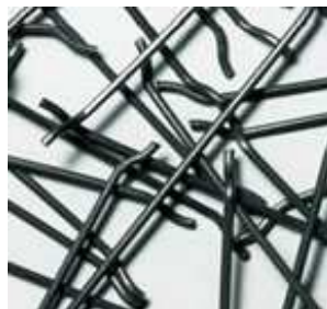
b) Hooked end Fibres