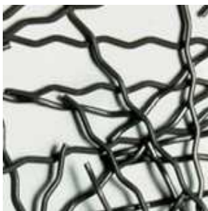
a) Undulated Steel Fibre

Types of steel fibres are as shown below