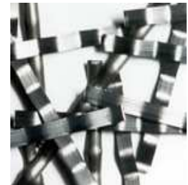
d) Crimped Steel Fibres